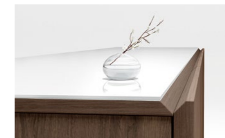
Add-on Glass Top can be specified as an option (pre-installed). *1/4" thick back-painted low-iron clear glass